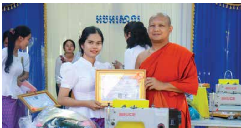
EMPOWERING FUTURES WITH LHA