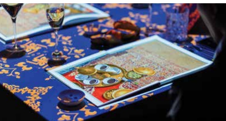
LE PETIT CHEF