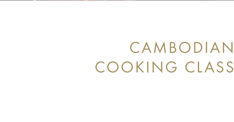
CAMBODIAN COOKING CLASS