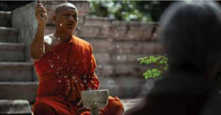
THE SACRED BLESSING