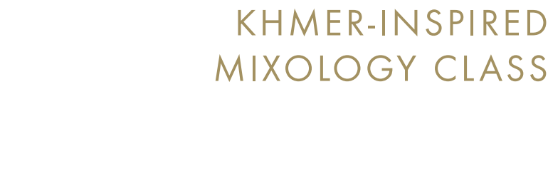
KHMER-INSPIRED MIXOLOGY CLASS