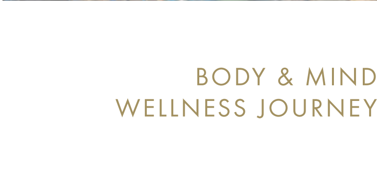
BODY & MIND WELLNESS JOURNEY