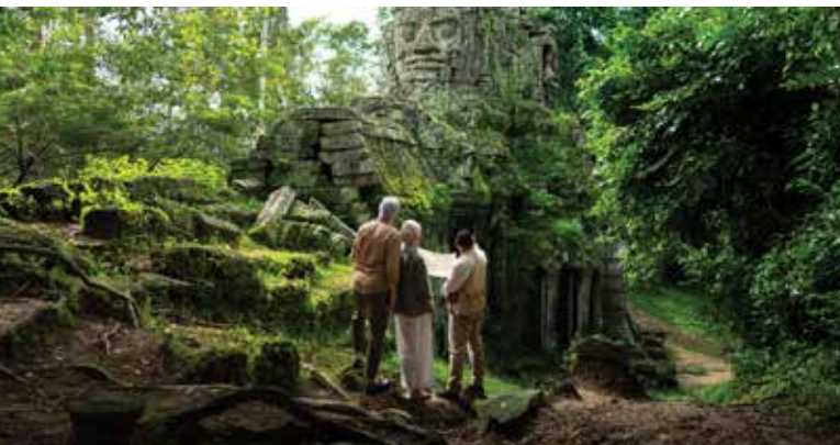
SOUL OF SIEM REAP