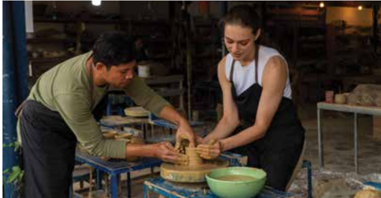
THE ART OF KHMER POTTERY