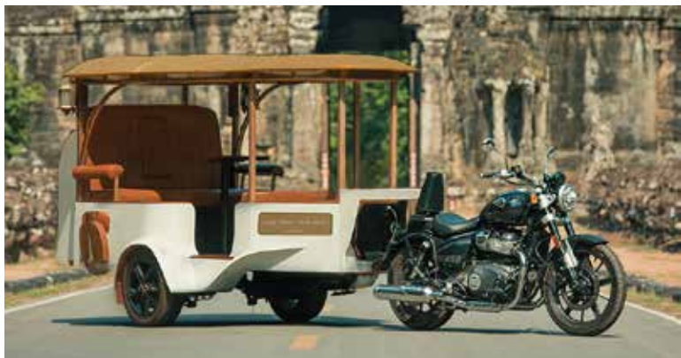
THE LUXURIOUS RIDE