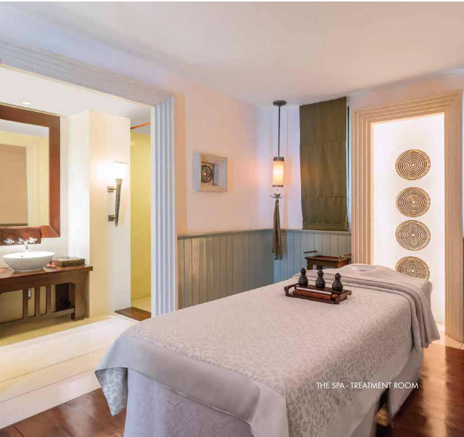
THE SPA - TREATMENT ROOM

Gracefully and smoothy, The Spa's treatments help rediscover the serenity, purity and beauty you seek.