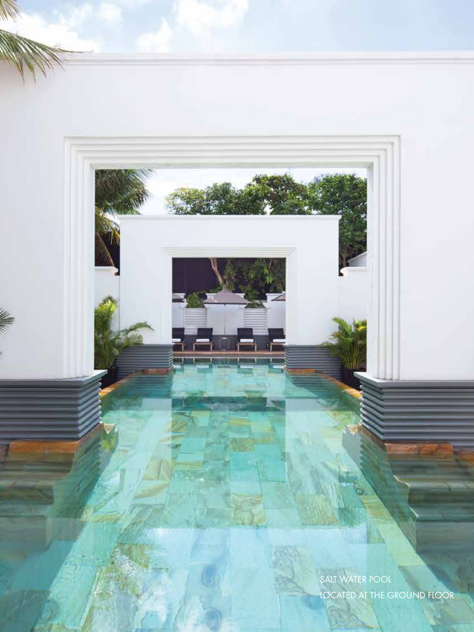
SALT WATER POOL LOCATED AT THE GROUND FLOOR