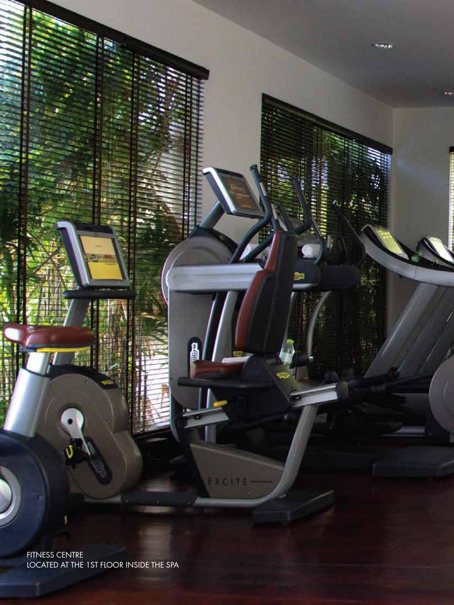
FITNESS CENTRE LOCATED AT THE 1ST FLOOR INSIDE THE SPA